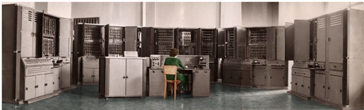
Computer in Kyiv, 1958