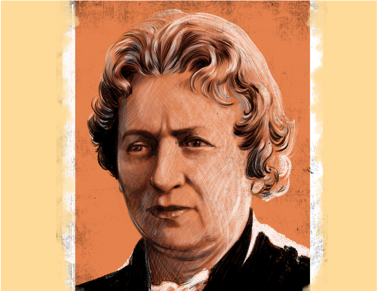
Kateryna Lohvynivna Yushchenko